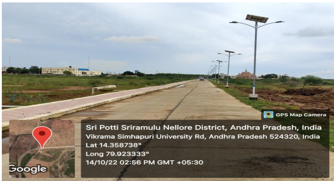
Solar Lights at the Entrance Road to VSU