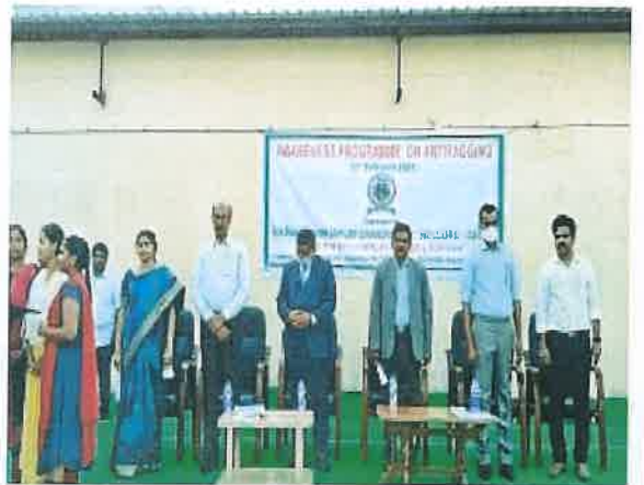
Anti-Ragging Awareness Programme date 23.02.2021