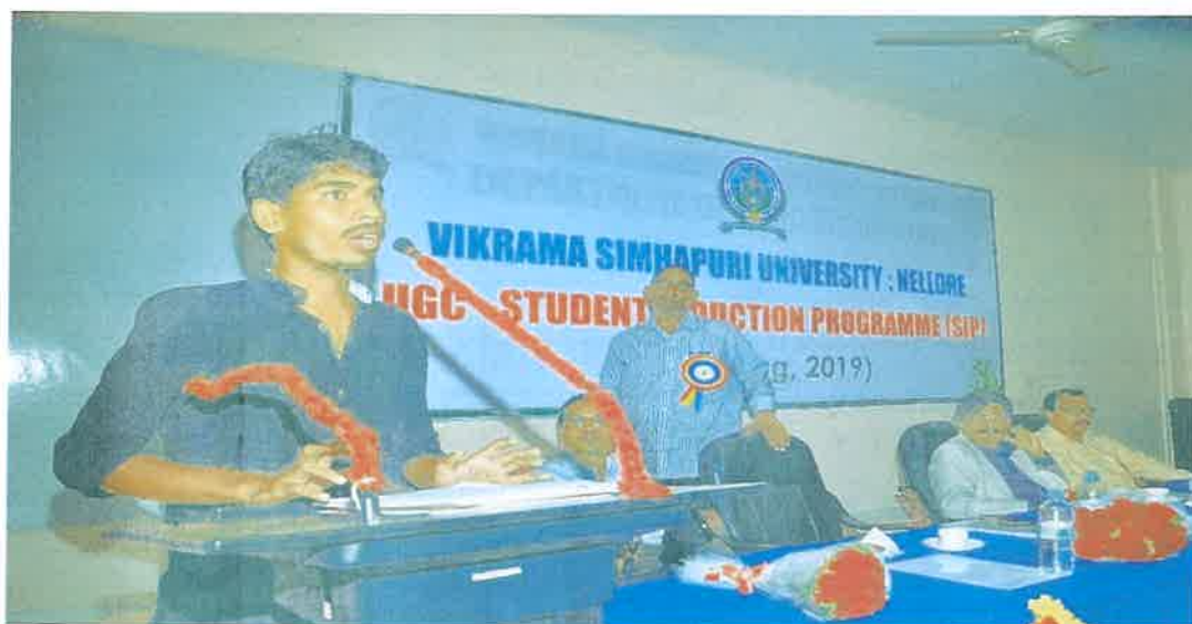
Students giving feedback on students induction programme Date:09.08.2019