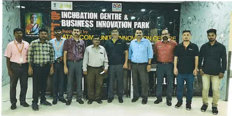
Delegates from various institutions