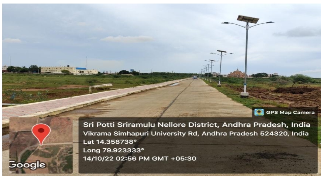
Solar Lights at the Entrance Road to VSU