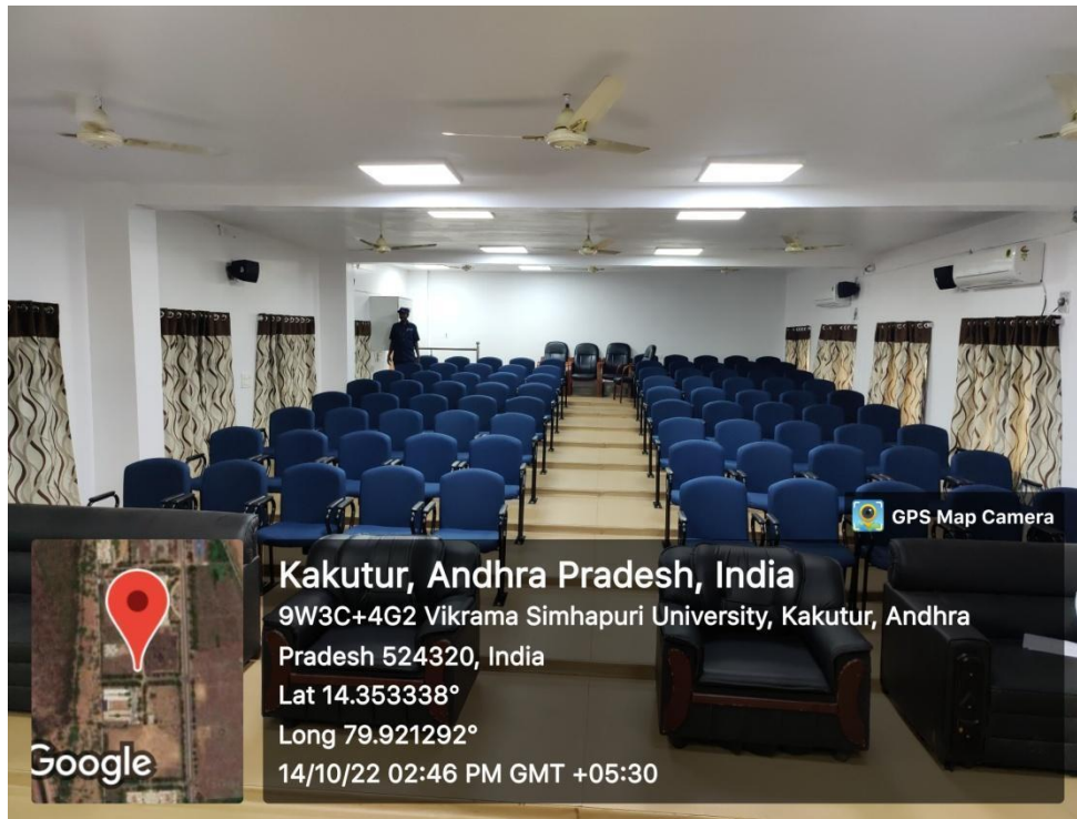
Led lighting arrangement at Sir C V Raman Seminar Hall