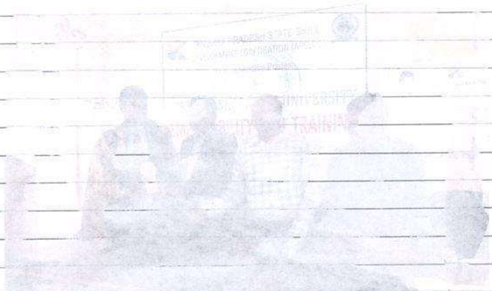
PARTICIPANTS IN EMPLOYABILITY SKILL TRAINING