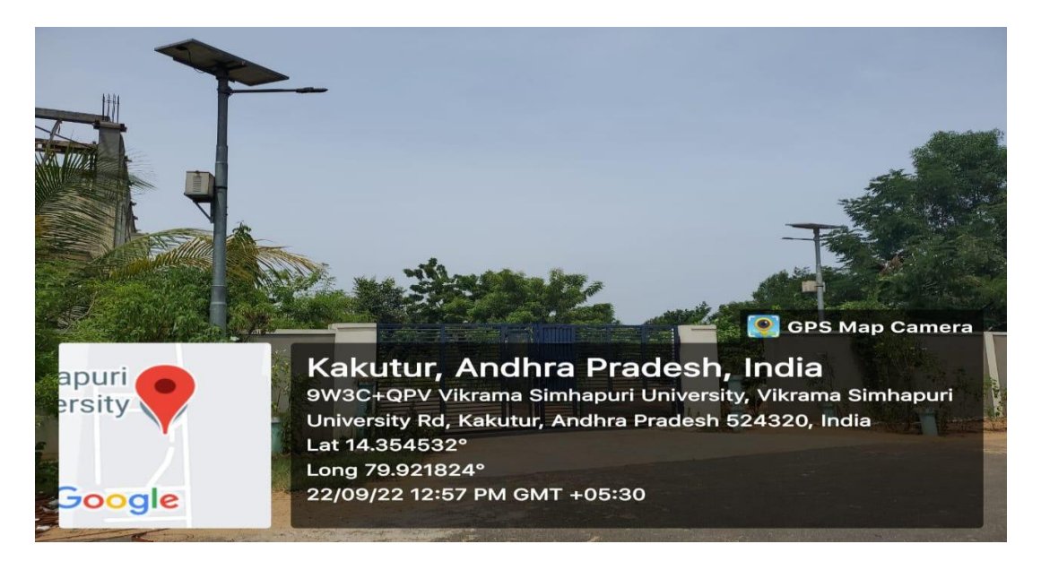
Solar Street Lights in front of 'Swarna Mukhi Women Hostel'