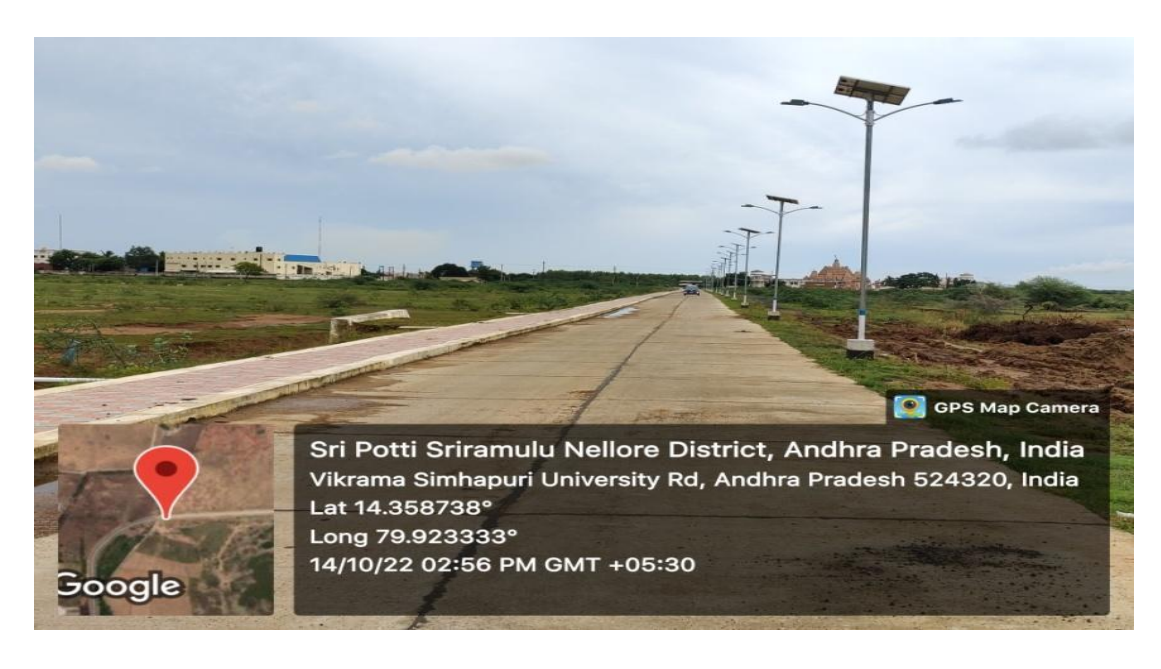
Solar Lights at the Entrance Road to VSU