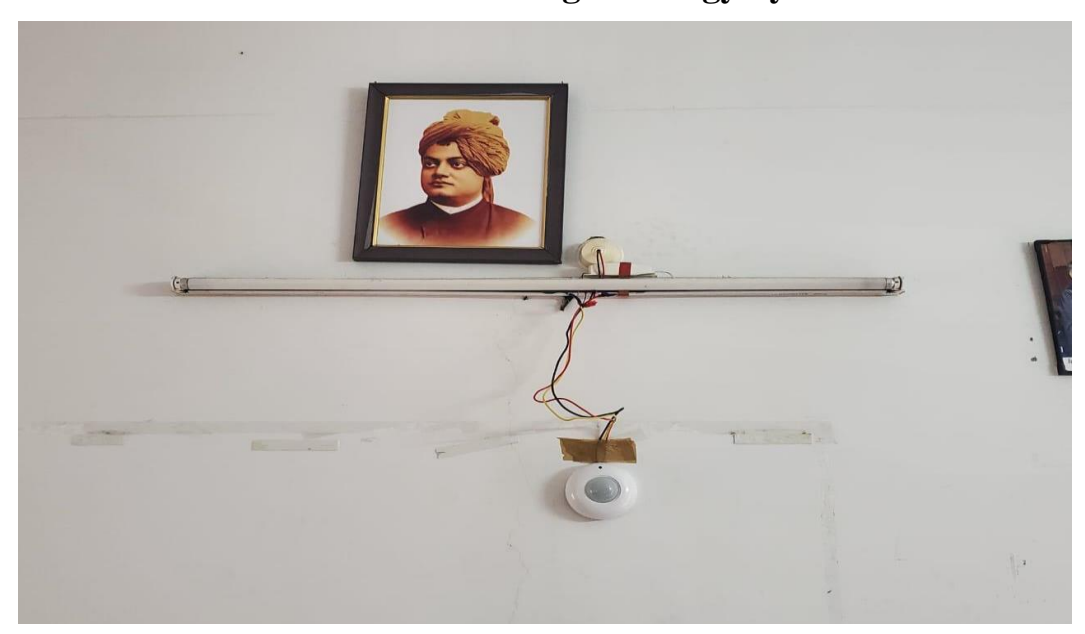
Sensor Based Light Energy System