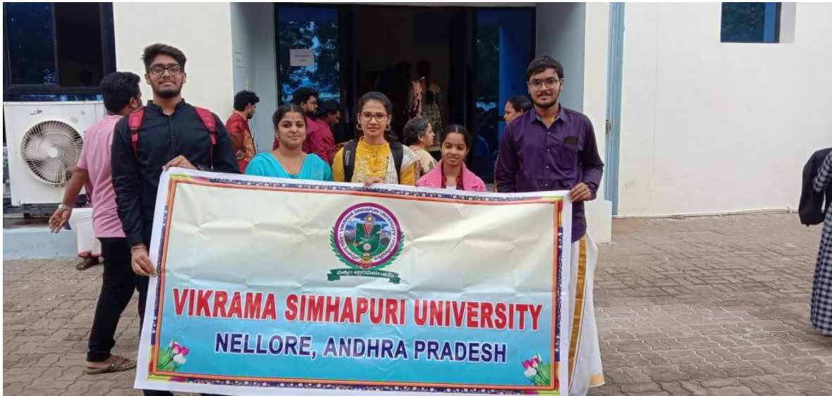
Students participated in in Alagu Fest-2019 Rally