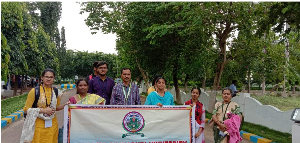
Students participated in in Alagu Fest-2019 Rally