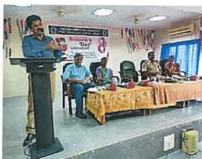
Address by Chief Guest