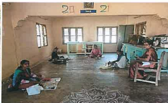
Competition on Preparing "Best out of Waste"