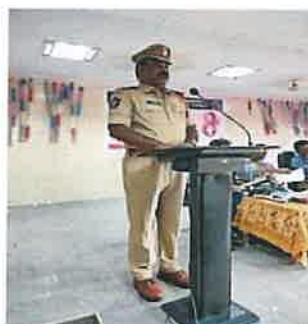
Address by Guest of Honour