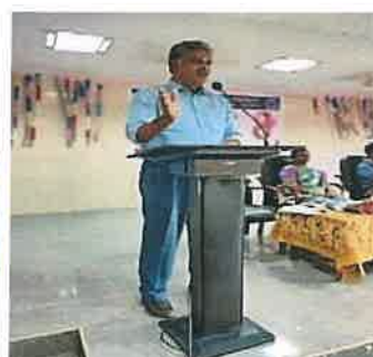
Address by Special Officer