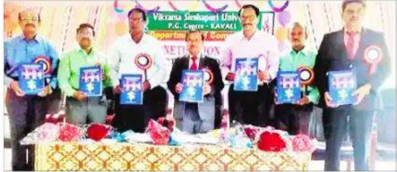
డీమానిటిజేషన్ ఇన్ ఇండియా ఇంపాక్ట్ అండ్ ప్రొస్పెక్టస్ పుస్తకాన్ని ప్రదర్శిస్తున్న దృశ్యం