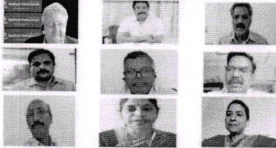
International Webinar on "COVID-19 Pandemic- Impact on Sustainable Fishery Sector and Global Trade (CPISFSG-2020)"