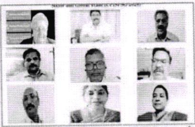
వెంకటాచలం, ఆగస్టు 17 : మత్స్య సంబంధిత రంగాలలోని ఉత్పత్తులు వాటి ఎగుమతులు మరియు దిగుమతులపై కరోనా-19 యొక్క ప్రభావం సమన్వయం అందించడం కొరకు తీసుకోవలసిన జాగ్రత్తలు మరియు పాటించవలసిన మేలకువలను, ఆక్వారంగం