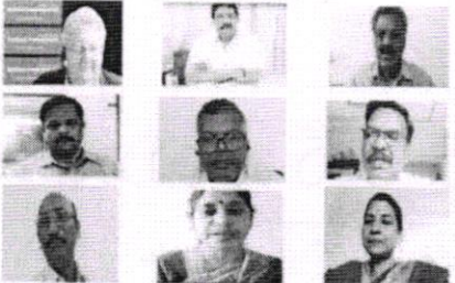
International Webinar on "COVID-19 Pandemic- Impact on Sustainable Fishery Sector and Global Trade (CPISFSG-2020)"