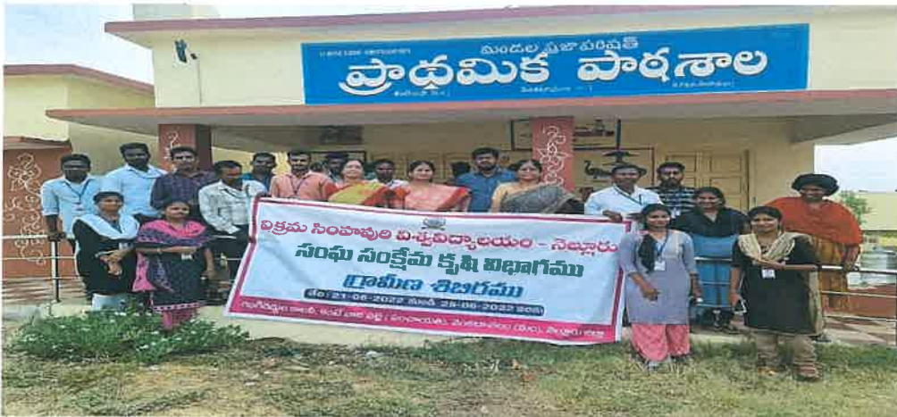
The Faculty and the students of MSW course started the rural camp and prepared for rally in Kantepalli village on 21/06/2022.