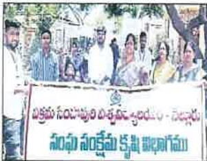
రూరీ నిర్వహిస్తున్న సోషల్ వర్క్ విద్యార్థులు

వెంకటాచలం, జూన్ 23 : మండలంలోని కంటేపల్లి పంచాయతీలోని గంగరెడ్డు కాలనీలో గురువారం విక్రమ సింహపురి యూనివర్సిటీ (వీఎస్యూ) సోషల్ వర్క్ విభాగం ఆధ్వర్యంలో విద్యార్థులు