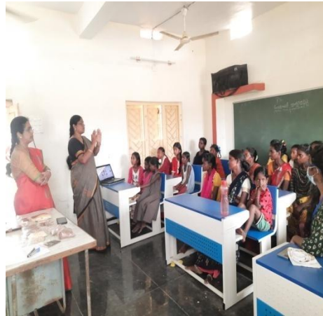
The faculty of Department of Social Work address the women at Primary school, Kante Palli on 23/06/2022