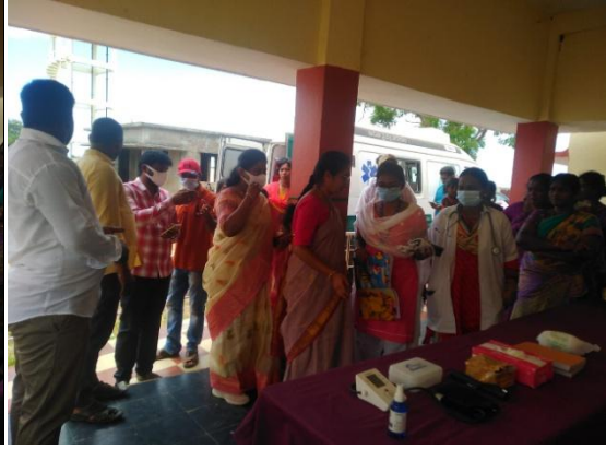
Inaguration of Medical Camp by MPTC member, Sri,Siva garu at Rural camp On 24/06/2022