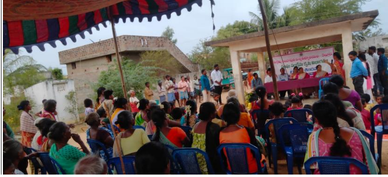
Day-5- Rural camp at Gangireddula Colony, Kantepalli (25/06/2022)