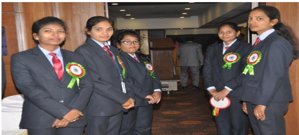
Students of MBA Department welcoming the Guests

Key personality of this interaction especially all Heads of the Departments, and Officials of the Industries are most admirable in this workshop success. Also all electronic and print media personnel who did great job for coverage of the programme to the rest of the world