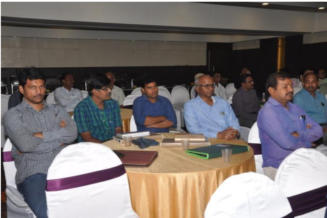
Delegates from the industries participated in University Industry Interaction programme