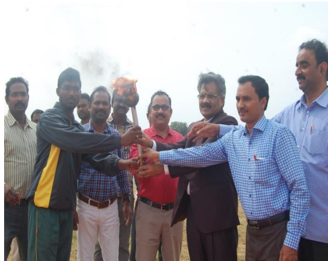
Flag hoisting and Lightning the lamp by Hon'ble Vice-Chancellor Prof.R.Sudarsana Rao