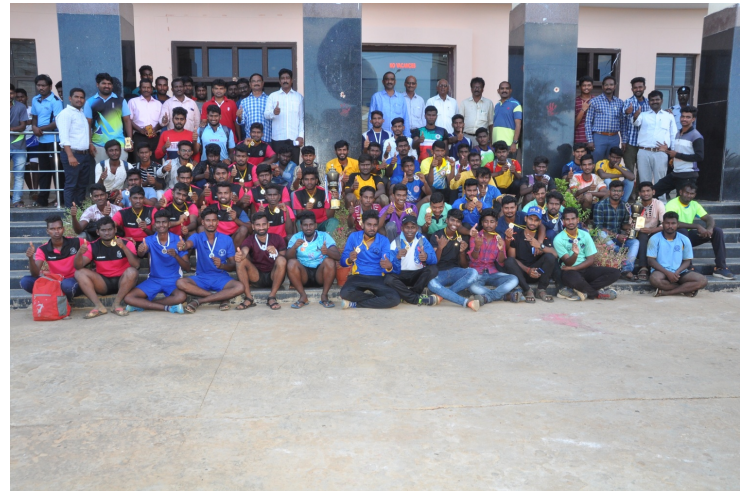
V.S.University Inter Collegiate Soft Ball, Kabaddi, Chess, Taekwondo and Yoga Men tournament opening ceremony 2019-20