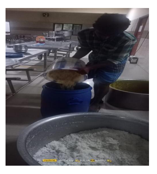
Collecting the food waste at Men Hostel