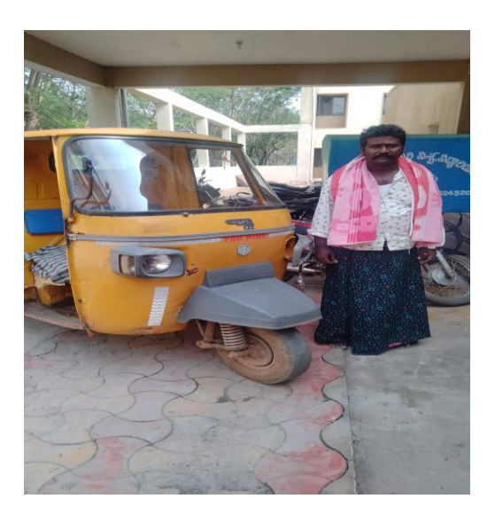
Taking the food waste in a vehicle to feed cattle