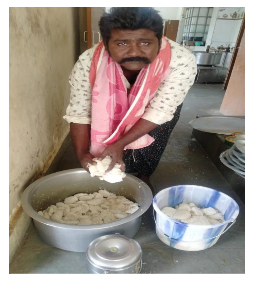
Collecting the food waste at Women Hostel