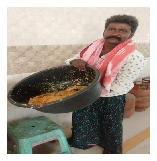
Collecting the food waste in the next day morning to feed the cattle